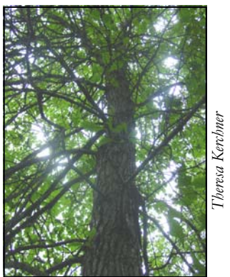
swamp white oak (Quercus bicolor); or bur oak (Quercus macrocarpa) or hybrid